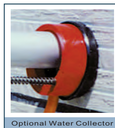
Optional Water Collector