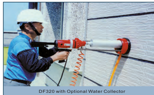
DF320 with Optional Water Collector