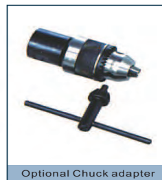
Optional Chuck adapter