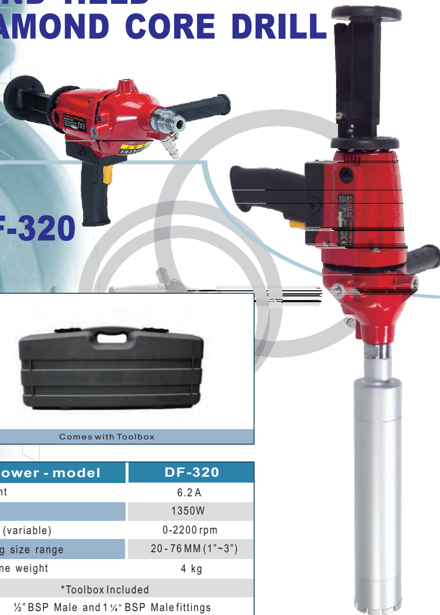
Comes with Toolbox