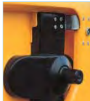
Lid lock integrated into the hinge

Once a yellow bag is placed in an OTTO Clinical Waste Container and the lid lock snaps shut, it need not be handled again. The container is secure and mobile, from ward or surgery to the incinerator – no secondary handling. A closed cycle in the fullest sense.