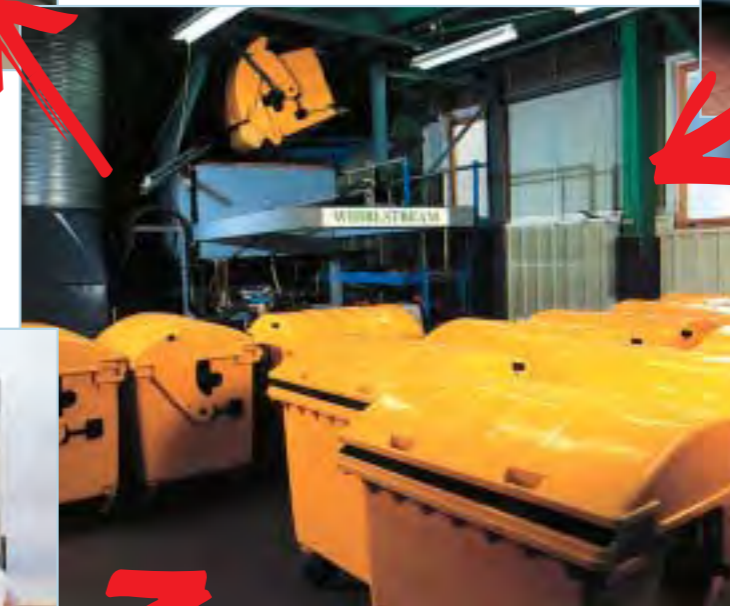
1100 litre containers emptying directly into the incinerator hopper