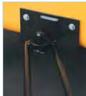
Durable towing bracket