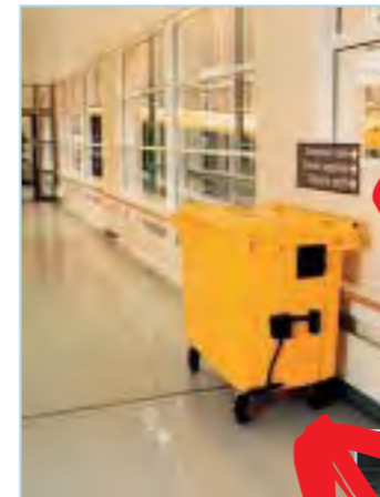
660 litre containers at ward