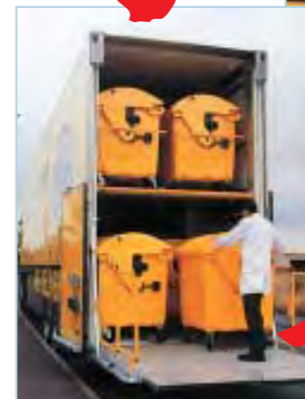
Safely sealed containers are transported to the incinerator site