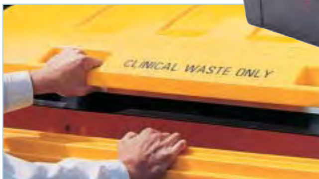
Lid designed to avoid trapped fingers